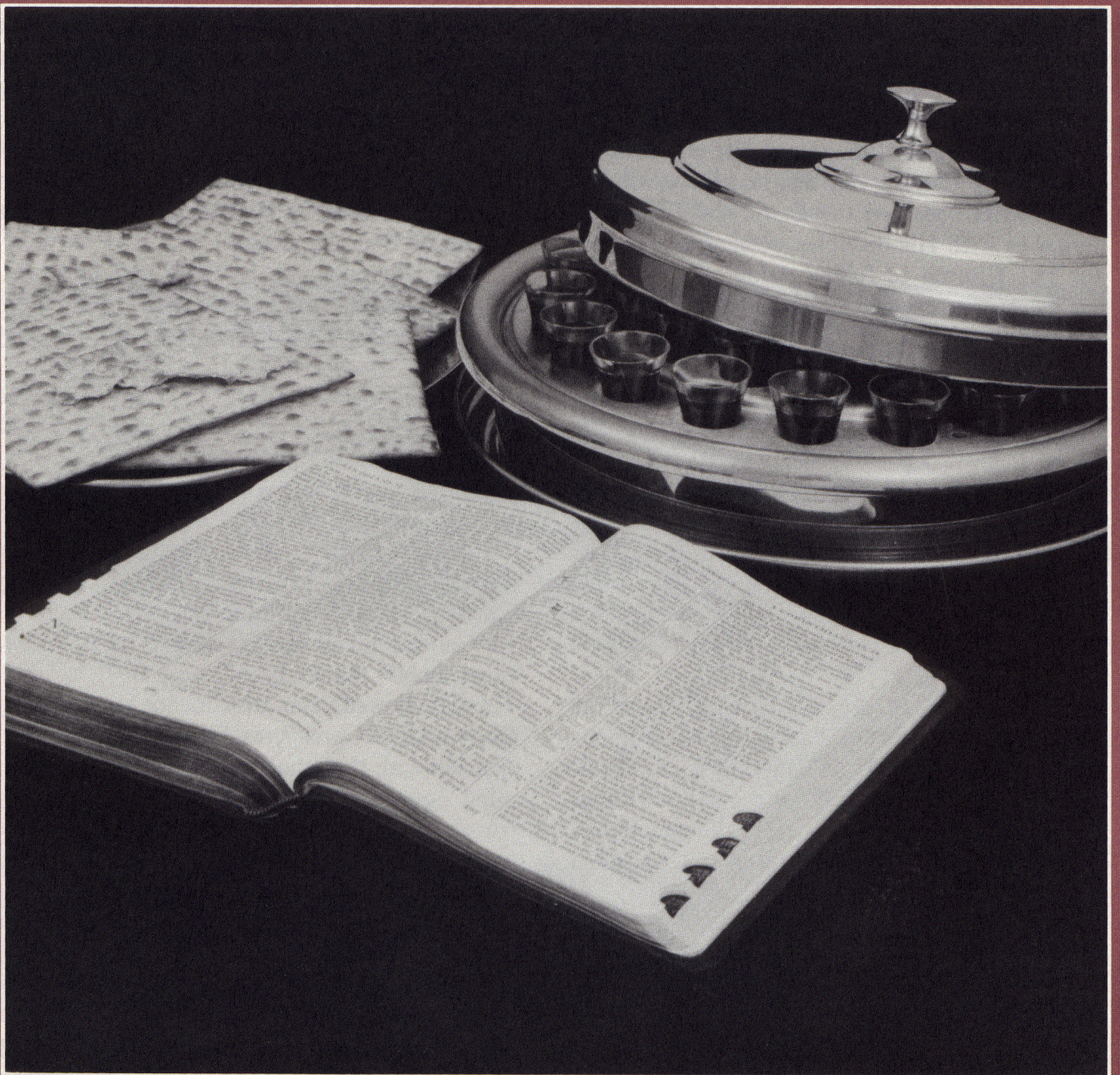
Christ's Final Passover